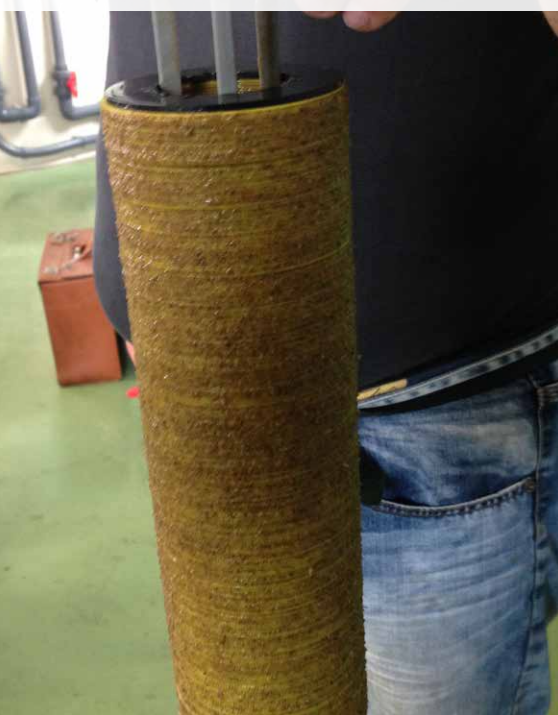
CLOGGED DISK FILTER

With this little shrewdness you have lot of advantages: